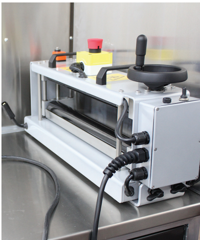
E-Roller with grip coated brushless rollers, digital counter and foot pedal controller