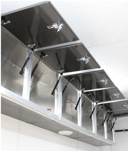
Ample overhead storage with locking cabinets