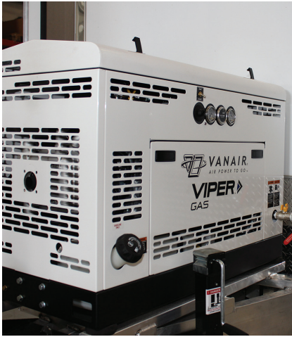
Vanair® 80 CFM/110 psi air compressor