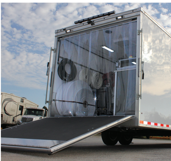
Rear ramp door for easy transport of equipment and materials

Delivering proven infrastructure rehabilitation products and equipment for more than 30 years , the Quad-Cure CIPP Lining Trailer is the latest addition to the extensive line-up of industry leading equipment, complementing the Quad-Cure resins and liners , to offer a complete system.