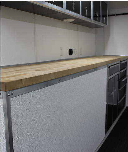
Solid wood workbench counter