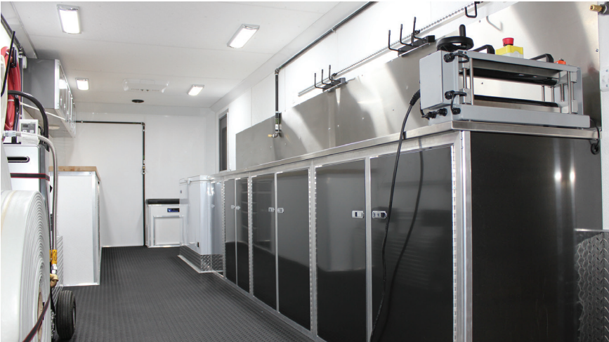
High traction flooring with broad workspace and undercounter storage