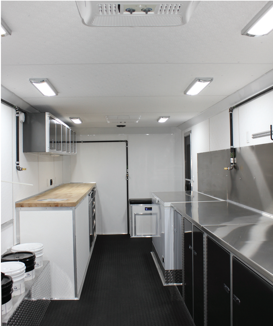
Dual ceiling mounted A/C system for comfortable working environment during summer season