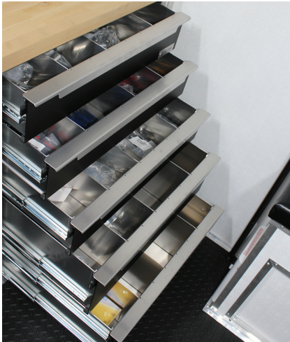
Plenty of drawer space for 655 piece tool set