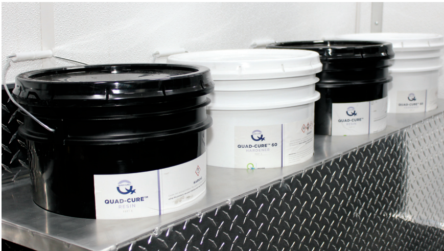
Resin bucket rack keeps resin secure during transport