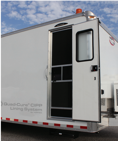
Side entry double door