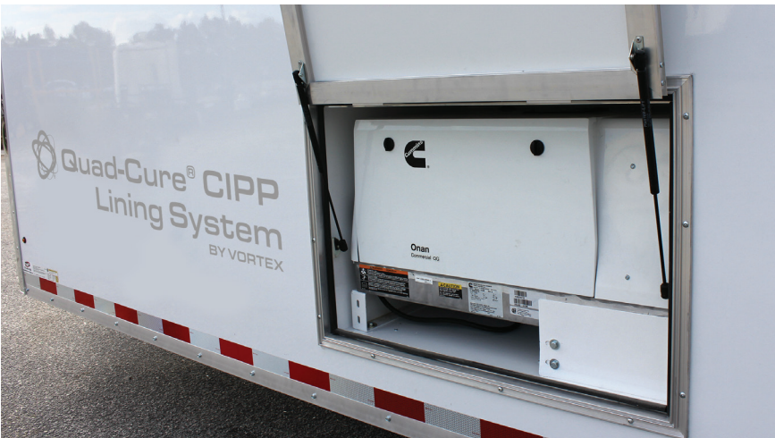
Commercial grade Cummins® ONAN 7000 generator