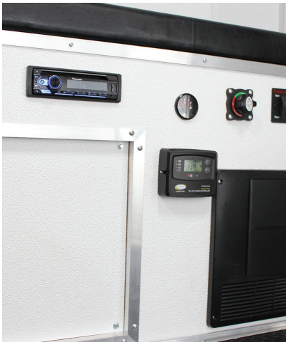
Control dashboard for lights, heat, A/C, stereo and more