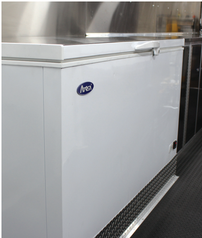
Thermostatically controlled fridge/freezer