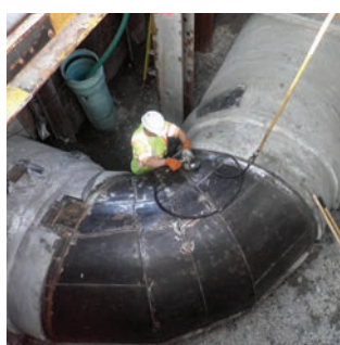
WET WELL & JUNCTION BOX REHABILITATION