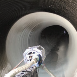
PIPE & CULVERT RELINING