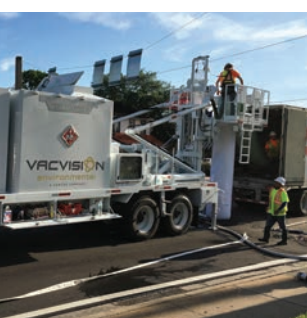
CIPP LINING SERVICES