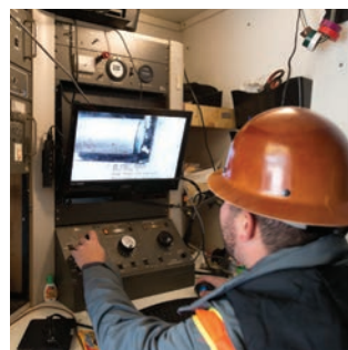
CLEANING & INSPECTION